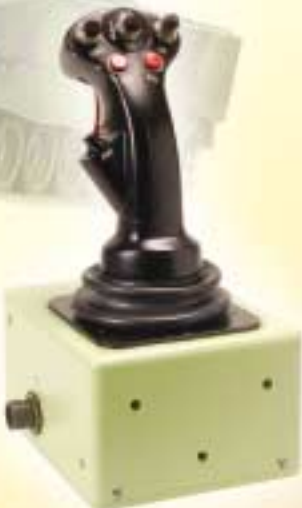
Hall Effect Control ITSS Marine LAV