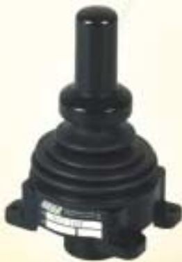
iBOT Wheelchair Joystick