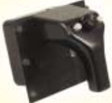
Prowler Cursor Control