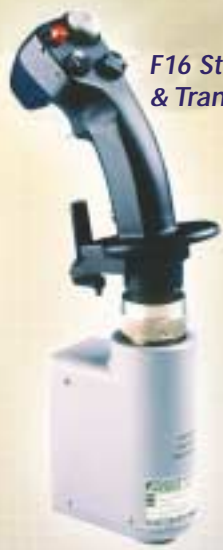
F16 Stick & Transducer