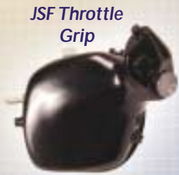
JSF Throttle Grip