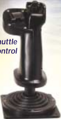
Space Shuttle Rotational Control