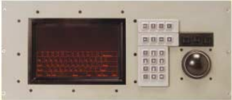
Nimrod RAP Panel