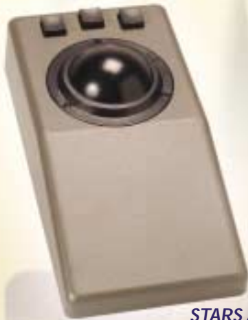
STARS ATC Trackball