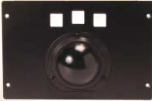
STARS ATC Panel Mount Trackball