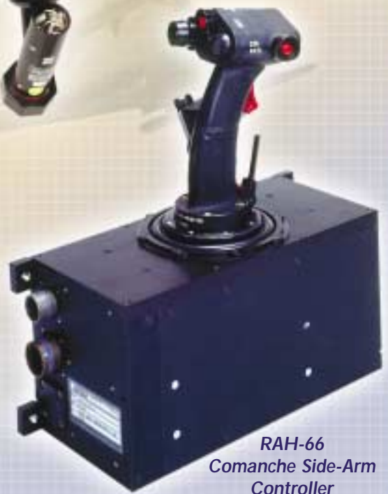
RAH-66 Comanche Side-Arm Controller