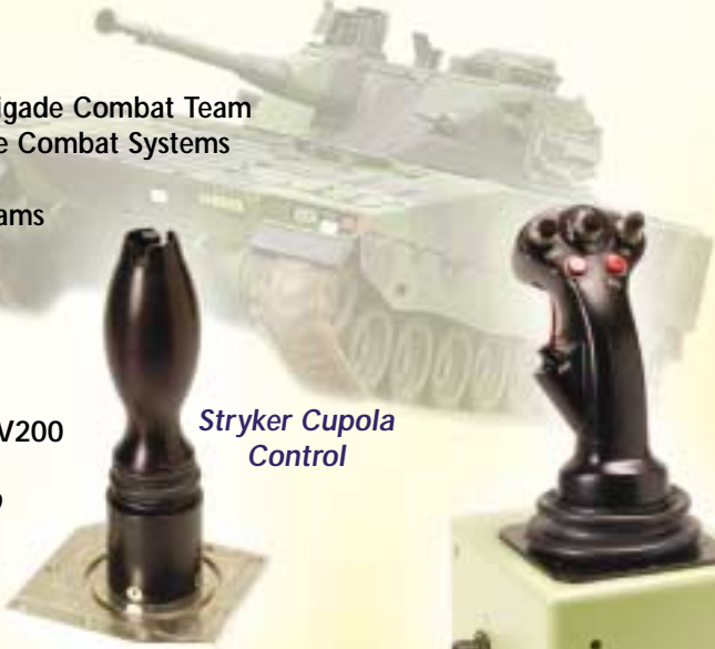
Stryker Cupola Control