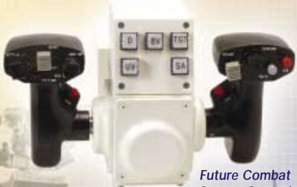
Future Combat System Control