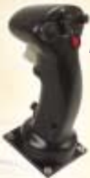
P3 Maverick Grip