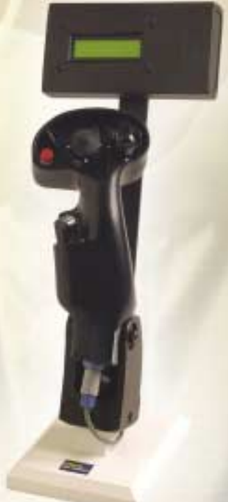
CANBus Interface Technology