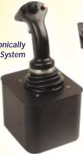
3 Axis Electronically Damped System