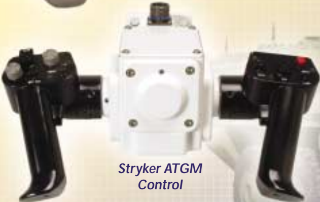
Stryker ATGM Control