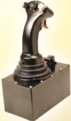
NLOS Stiff Stick Hall Effect Joystick