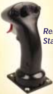
Remote Weapon Station Grip