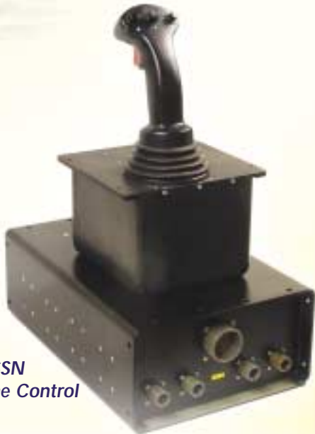
NSSN Submarine Control